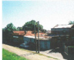
City of Darebin Heritage Review 2000