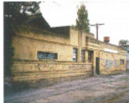
City of Darebin Heritage Review 2000