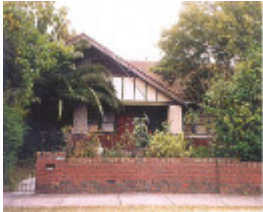
City of Darebin Heritage Review 2000