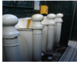
Urinal Nth Melbourne porcelain stalls KJ 21 06 2007