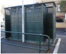
Urinal Nth Melbourne exterior KJ 21 07 2007