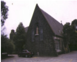
sacred heart church st georges church