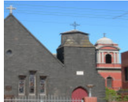
SACRED HEART CATHOLIC CHURCH SOHE 2008