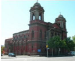
SACRED HEART CATHOLIC CHURCH SOHE 2008