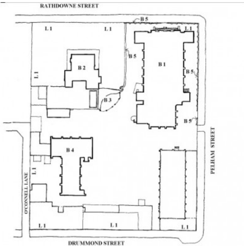
sacred heart church carlton registration plan