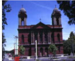
1 sacred heart church front view