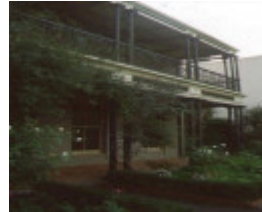
former presbyterian manse front view sw apr1999