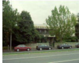
1 former presbyterian manse rathdowne street exterior sw apr1999