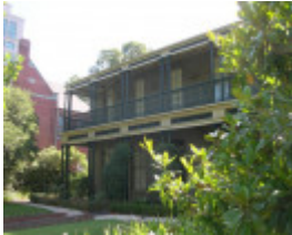
FORMER PRESBYTERIAN MANSE SOHE 2008