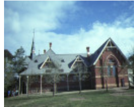
1 primary school number 123 california gully front view jul1984