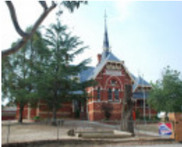
PRIMARY SCHOOL NO. 123 SOHE 2008