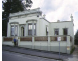
1 medical rooms mostyn street castlemaine front view