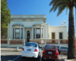
MEDICAL ROOMS SOHE 2008