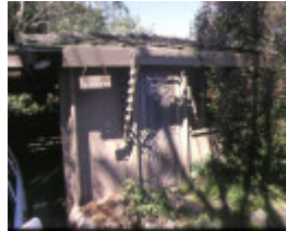
1 gumnuts frankston entrance