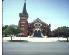
1 st andrews echuca front view feb1983