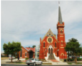
ST ANDREWS UNITING CHURCH SOHE 2008