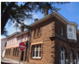
H0618 FORMER ARARAT SUB-TREASURY AND POST OFFICE LHA 2015 2.JPG