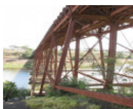
2504_Melton Railway Viaduct_7 November 2009_HV_026_lo res.jpg