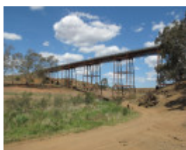
2504_Melton Railway Viaduct_7 November 2009_HV_007_lo res.jpg