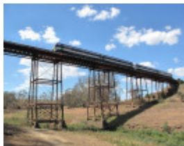
2504_Melton Railway Viaduct_7 November 2009_HV_041_lo res.jpg