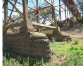
2504_Melton Railway Viaduct_7 November 2009_HV_055_lo res.jpg