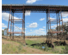
2504_Melton Railway Viaduct_7 November 2009_HV_056_lo res.jpg