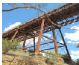
2504_Melton Railway Viaduct_7 November 2009_HV_017_lo res.jpg