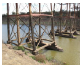
2504_Melton Railway Viaduct_7 November 2009_HV_012_lo res.jpg