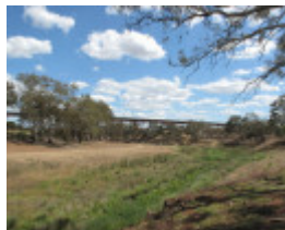
2504_Melton Railway Viaduct_7 November 2009_HV_005_lo res.jpg