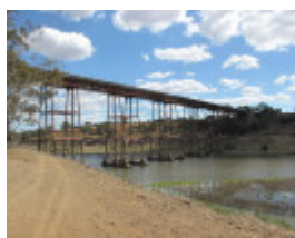
2504_Melton Railway Viaduct_7 November 2009_HV_009_lo res.jpg