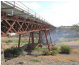
2504_Melton Railway Viaduct_7 November 2009_HV_069_lo res.jpg