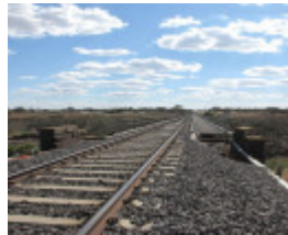
2504_Melton Railway Viaduct_7 November 2009_HV_072_lo res.jpg