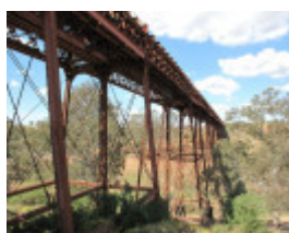
2504_Melton Railway Viaduct_7 November 2009_HV_030_lo res.jpg