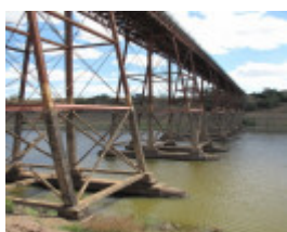
2504_Melton Railway Viaduct_7 November 2009_HV_013_lo res.jpg