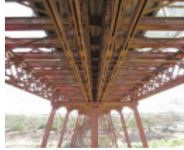
2504_Melton Railway Viaduct_7 November 2009_HV_068_lo res.jpg