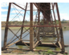
2504_Melton Railway Viaduct_7 November 2009_HV_019_lo res.jpg