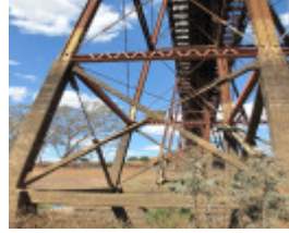
2504_Melton Railway Viaduct_7 November 2009_HV_048_lo res.jpg