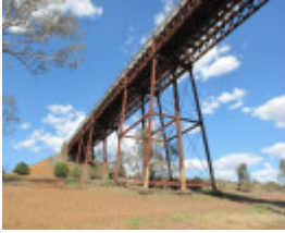
2504_Melton Railway Viaduct_7 November 2009_HV_058_lo res.jpg