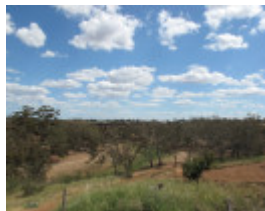
2504_Melton Railway Viaduct_7 November 2009_HV_001_lo res.jpg