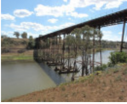
2504_Melton Railway Viaduct_7 November 2009_HV_032_lo res.jpg