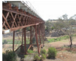
2504_Melton Railway Viaduct_7 November 2009_HV_070_lo res.jpg