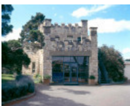
h02058 delgany portsea garage sept03 mz