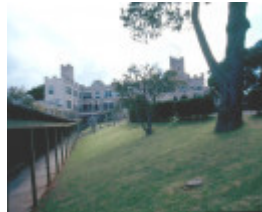
h02058 delgany portsea 1925 1953 1968 wings sept03 mz