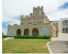
DELGANY SOHE 2008