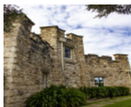
Delgany Garage image 3