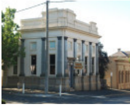
FORMER STATE SAVINGS BANK SOHE 2008