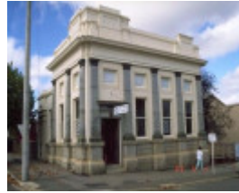
h0580 former state savings bank h0580