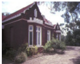
1 residence farnsworth street castlemaine front view may1984