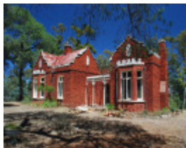
RESIDENCE SOHE 2008