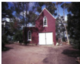
residence farnsworth street castlemaine outbuilding may1984