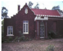
residence farnsworth street castlemaine side view may1984