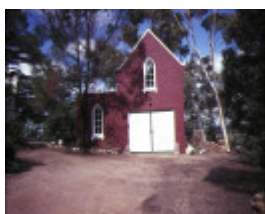
residence farnsworth street castlemaine outbuilding may1984