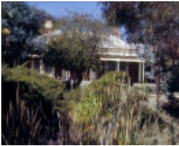
h00721 kaweka hargreaves street castlemaine house from pond she project 2003