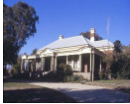
h00721 kaweka hargreaves street castlemaine front of home she project 2003