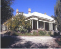
h00721 1 kaweka hargreaves street castlemaine house from drive she project 2003