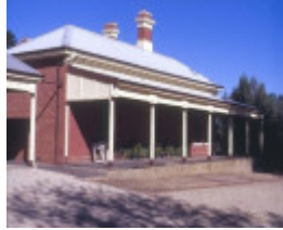
h00721 kaweka hargreaves street castlemaine east side she project 2003