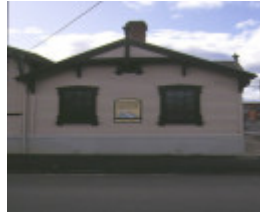
drill hall lyttleton street castlemaine front detail