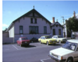
1 drill hall lyttleton street castlemaine front view