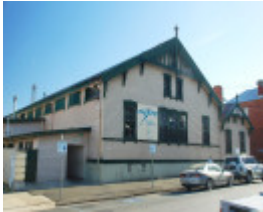
DRILL HALL SOHE 2008