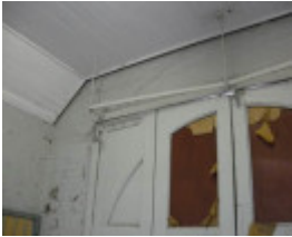
Timber-boarded ceiling junction with south and west walls inside the former fire engine room