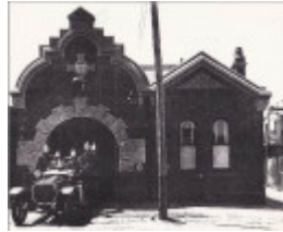
c.1918: Selwyn Street elevation with Hotchkiss Fire Engine and crew. The Station's original roof materials are visible