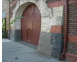
The horseshoe arch integrates limestone, trachyte and basalt with the brickwork