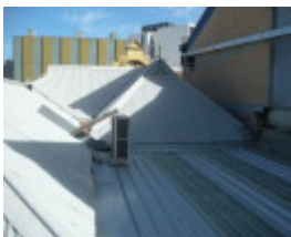
Looking towards the west (Selwyn Street) at the 1896 building's roofscape