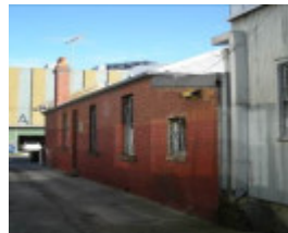
South elevation looking west towards Selwyn Street from un-named laneway