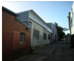
South elevation looking east towards St Georges Road from un-named laneway