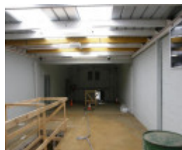
Looking west towards the fire engine room from the space formed by the mid-1950s roofing of the former yard