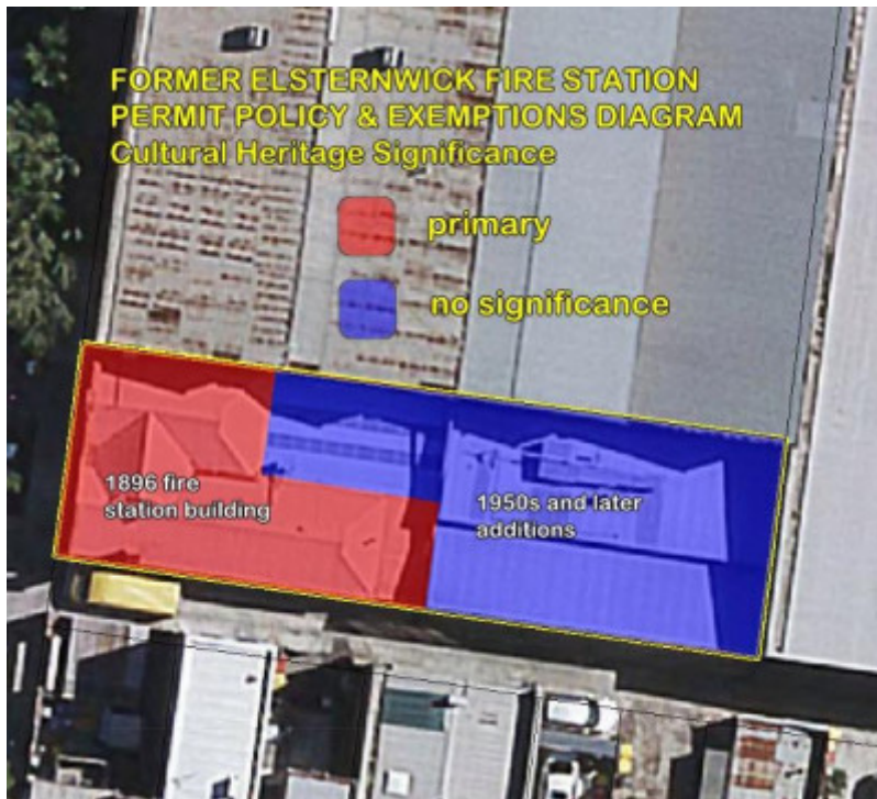
Former Elsternwick Fire Station PERMIT POLICY AND EXEMPTIONS DIAGRAM 10 August 2017