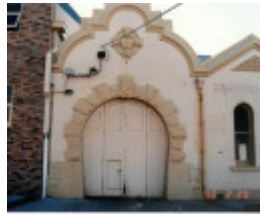
1990: at time of purchase by ABC, prior to removal of exterior paint