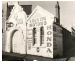
1974: re-purposed as the Esquire Motors garage