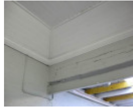
Steel lintel supporting a remnant of the 1896 building's east wall in the north-east corner of the former fire engine room