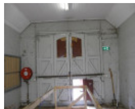
Looking west at the timber and glass doors to the former fire engine room