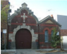
Selwyn Street (west-facing) facade