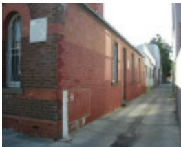
View from Selwyn Street along un-named laneway, showing painted areas of face brickwork on south elevation