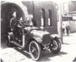
c.1918: Hotchkiss Fire Engine and crew at the horseshoe arch on Selwyn Street