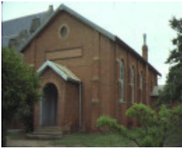
congregational church lyttleton street castlemaine former church at rear jan1979