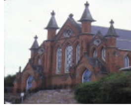
1 congregational church lyttleton street castlemaine front view congregational church