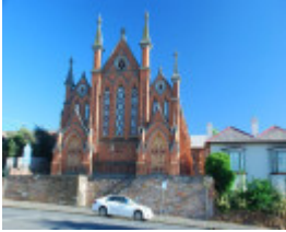
PRESBYTERIAN CHURCH SOHE 2008