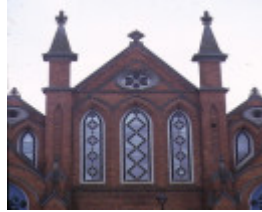
congregational church lyttleton street castlemaine detail front congregational church