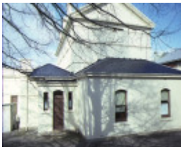
castlemaine court house lyttleton street castlemaine rear view aug1984