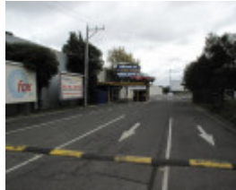
Coburg Drive In_8 May 2009_mz_Driveway