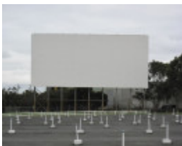
Coburg Drive In_8 May 2009_mz_Screen 1