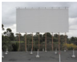
Coburg Drive In_8 May 2009_mz_Screen 2