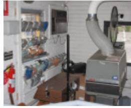
Coburg Drive In_8 May 2009_mz_Speakers