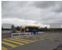
Coburg Drive In_8 May 2009_mz_Projection Building and Screens 2 and 3