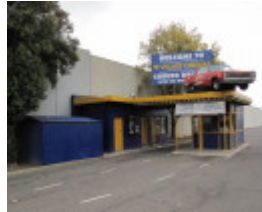
Coburg Drive In_8 May 2009_mz_Ticket Booth and Dodge Phoenix