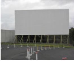
Coburg Drive In_8 May 2009_mz_Screen 3