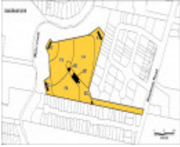
Coburg Drive In_8 May 2009_mz_Field 1