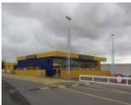
Coburg Drive In_8 May 2009_mz_Diner