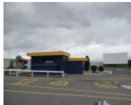
Coburg Drive In_8 May 2009_mz_Projection Building