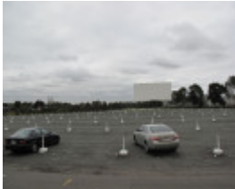
Coburg Drive In_8 May 2009_mz_Field 1