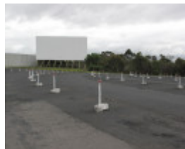
Coburg Drive In_8 May 2009_mz_Field 2 and Screen 3