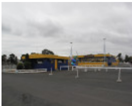
Coburg Drive In_8 May 2009_mz_Diner and Projection Building