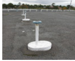
Coburg Drive In_8 May 2009_mz_Speaker Stands