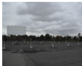
Coburg Drive In_8 May 2009_mz_Field 2