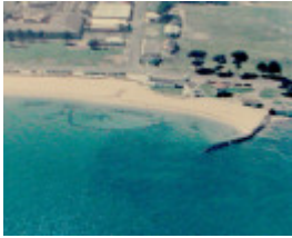
Lillington Baths Williamstown c1980 Back Beach Aerial Photo