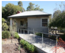
H2167 Lady Northcote Camp Office former Cook's Cottage