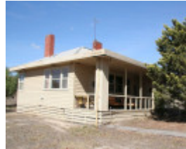
H2167 Lady Northcote Camp House 12