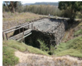
H2167 Lady Northcote Camp Sewerage System