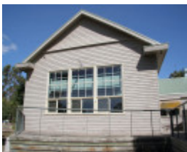
H2167 Lady Northcote Camp Dining Hall