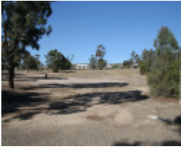
H2167 Lady Northcote Camp 1