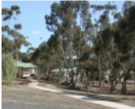
H2167 Lady Northcote Camp