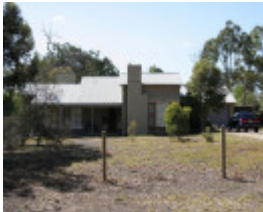
H2167 Lady Northcote Camp Manager's Residence