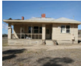
H2167 Lady Northcote Camp House 11