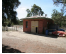
H2167 Lady Northcote Camp Maintenance Shed