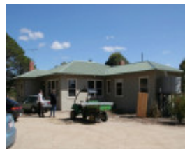
Lady Northcote Camp Hospital