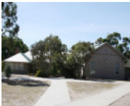
H2167 Lady Northcote Camp Dining Hall Kitchen