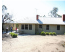
H2167 Lady Northcote Camp Angliss House