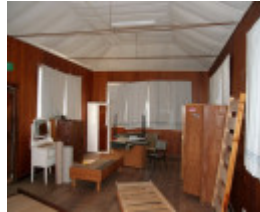
H2167 Lady Northcote Camp House 12 dormitory