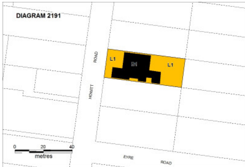
H2191 ernest fooks plan