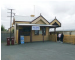
QUEENSCLIFF RAILWAY STATION SOHE 2008