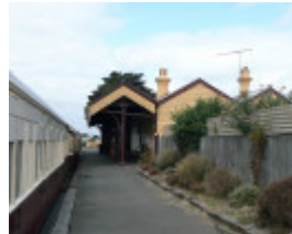
QUEENSCLIFF RAILWAY STATION SOHE 2008