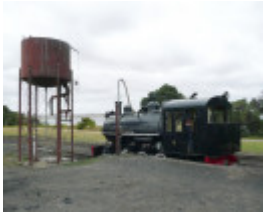
QUEENSCLIFF RAILWAY STATION SOHE 2008