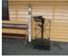
QUEENSCLIFF RAILWAY STATION SOHE 2008