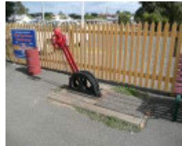
QUEENSCLIFF RAILWAY STATION SOHE 2008