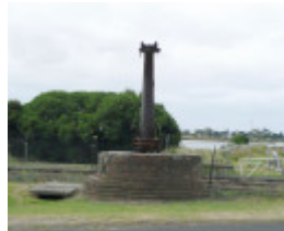
QUEENSCLIFF RAILWAY STATION SOHE 2008