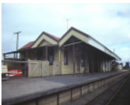
1 queenscliff railway station wharf street queenscliff front view aug1984