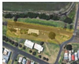
queenscliff railway station extent overlaid on air photo.JPG