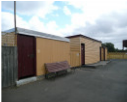
QUEENSCLIFF RAILWAY STATION SOHE 2008