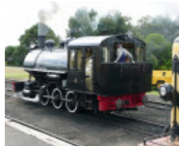
QUEENSCLIFF RAILWAY STATION SOHE 2008