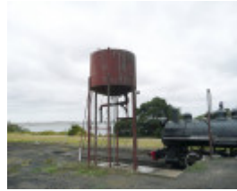
QUEENSCLIFF RAILWAY STATION SOHE 2008