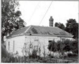
26947 Bailey Street No 35 Photo