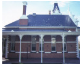
pyrenees house ararat from west jun1984