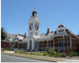
PYRENEES HOUSE SOHE 2008