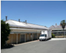
PYRENEES HOUSE SOHE 2008