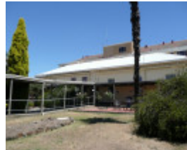
PYRENEES HOUSE SOHE 2008