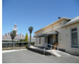
PYRENEES HOUSE SOHE 2008