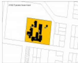
Pyrenees House Plan