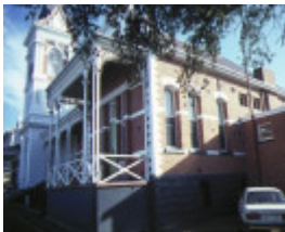
pyrenees house ararat from east jun1984