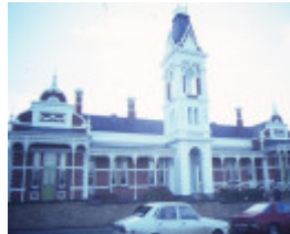
1 pyrenees house ararat front view jun1984