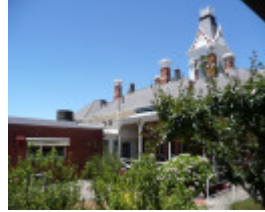
PYRENEES HOUSE SOHE 2008