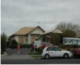
206 High Street, Belmont