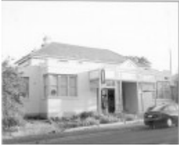
27038 Mt Pleasant Road No 31 Photo