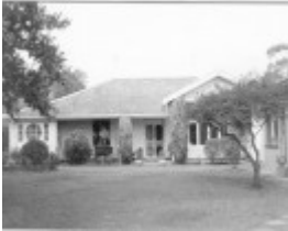
27058 Mt Pleasant Road No 79 Photo