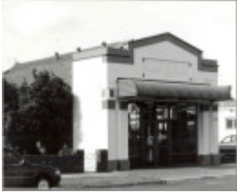
27097 Regent Street No 20 Photo