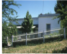
1 residence mostyn street castlemaine front view