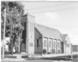
27102 Regent Street No 25 Photo