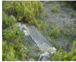
H1659 griffith island port fairy keepers quarters remains2