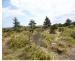
GRIFFITHS ISLAND SOHE 2008