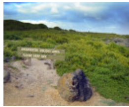
H1659 griffith island port fairy shearwater colony