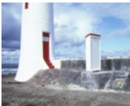
griffith island lighthouse griffith island port fairy entrance