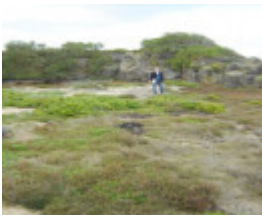
H1659 griffith island port fairy quarry2