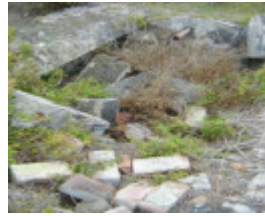
H1659 griffith island port fairy keepers quarters remains