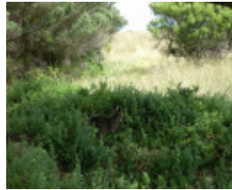
GRIFFITHS ISLAND SOHE 2008