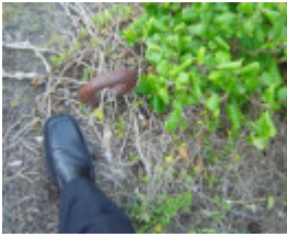
H1659 griffith island port fairy lighthouse mast footings