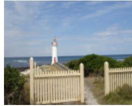
GRIFFITHS ISLAND SOHE 2008