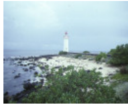
griffith island lighthouse griffith island port fairy landscape