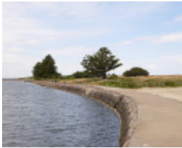
GRIFFITHS ISLAND SOHE 2008