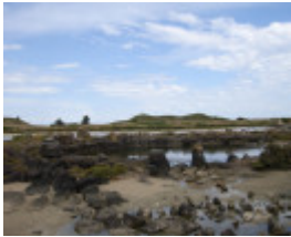
GRIFFITHS ISLAND SOHE 2008