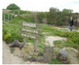
H1659 griffith island port fairy quarry3