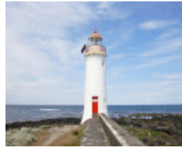
GRIFFITHS ISLAND SOHE 2008