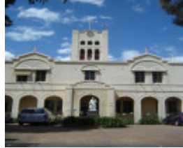
st vincent's boys orphanage sth Melbourne front