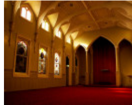
H2170 St Vincent de Paul Boys Orphanage chapel