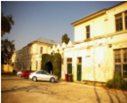
H2170 St Vincent de Paul Boys Orphanage rear cecil st buildings inc grotto detention plate