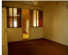
H2170 St Vincent de Paul Boys Orphanage dormitory 1857 building