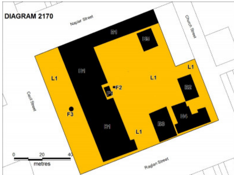
H2170 FORMER ST VINCENT DE PAUL BOYS ORPHANAGE (plan redrawn for clarity)