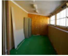
H2170 St Vincent de Paul Boys Orphanage napier building sleep out balcony