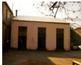
H2170 St Vincent de Paul Boys Orphanage 1958 gymnasium