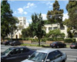
St Vincent Boys Orphanage Sth Melbourne Front view