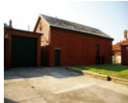
H2170 St Vincent de Paul Boys Orphanage c 1866 timber classroom