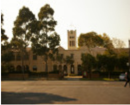
27209 St Vincent de Paul Boys Orphanage small