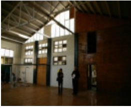
H2170 St Vincent de Paul Boys Orphanage gymnasium interior