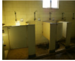
H2170 St Vincent de Paul Boys Orphanage childrens bathroom