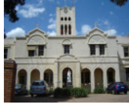
st vincent's boys orphanage sth Melbourne front entrance