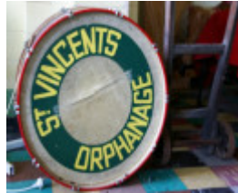
H2170 St Vincent de Paul Boys Orphanage drum