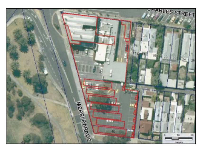
27270 Outline of 1905 hotel and residences