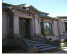
1 buda castlemaine entrance