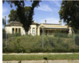
rosecraddock caulfield western side of house mar1992