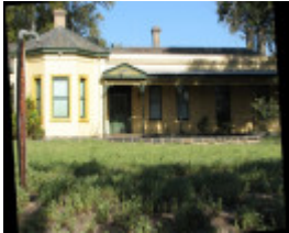
ROSECRADDOCK SOHE 2008