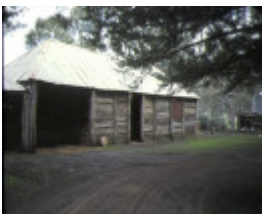
glenisl homestead glenisl via cavendish outbuilding jul1978