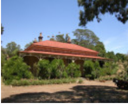
GLENISLA SOHE 2008