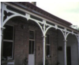
1 glenisl homestead glenisl via cavendish front of homestead jul1978