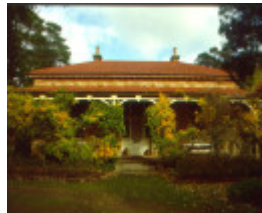
1 glenisl h444