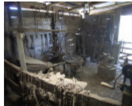
GLENISLA SOHE 2008