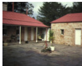
glenisl homestead glenisl via cavendish rear entrance jul1978