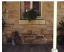
glenisl homestead glenisl via cavendish detail of stone wall sep1985