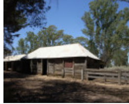
GLENISLA SOHE 2008