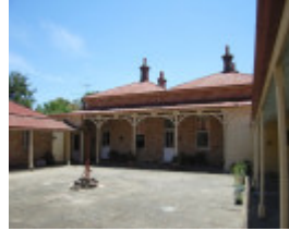
GLENISLA SOHE 2008