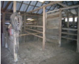
GLENISLA SOHE 2008