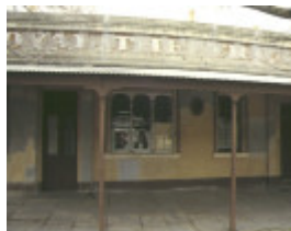
1 former royal hotel & theatre high street maldon front entrance sep1997