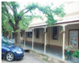
FORMER ROYAL HOTEL AND THEATRE SOHE 2008