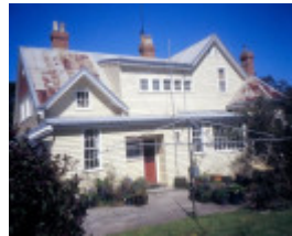
h01179 pastoria homestead baynton rd kyneton rear view she project 2003