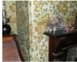
PASTORIA HOMESTEAD SOHE 2008