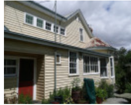
PASTORIA HOMESTEAD SOHE 2008