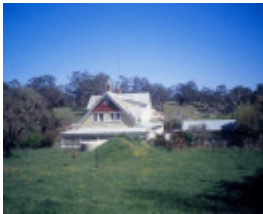
h01179 pastoria homestead baynton rd kyneton distant view she project 2003