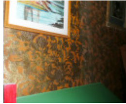
PASTORIA HOMESTEAD SOHE 2008