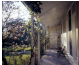
h01179 pastoria homestead baynton rd kyneton verandah she project 2003