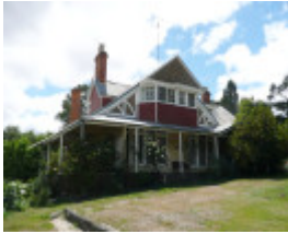
PASTORIA HOMESTEAD SOHE 2008