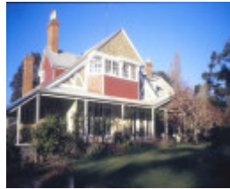
h01179 1 pastoria homestead baynton rd kyneton front view she project 2003