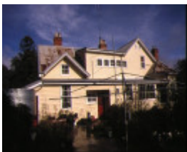
h01179 pastoria homestead kyneton baynton road pipers creek rear view