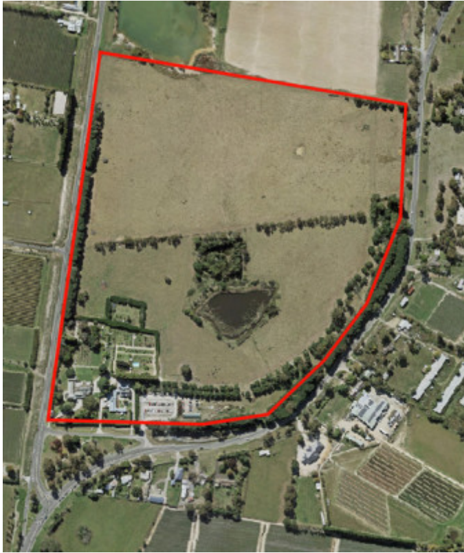
aerial extent of registration