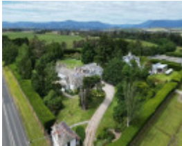
2023 Coombe Cottage