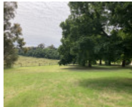
2023 avenue of elms RHS western end near the residence looking across the southern paddock