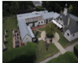
2015 stable yard with stables at centre with slate roof motor house with bell tower and 2015 additions