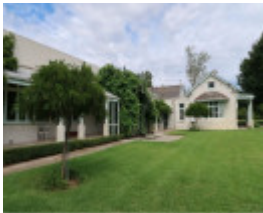
2022 view of north-east of Coombe Cottage looking west