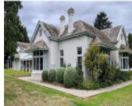
2022 view from southwest