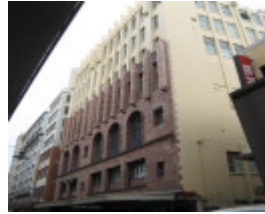
DJs former Coles_rear elevation_16 Jan 08