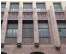
DJs former Coles_rear facade detail_16 Jan 08