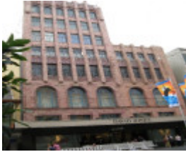
DJs former Coles_front facade_16 Jan 08