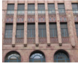
DJs former Coles_facade detail_16 Jan 08