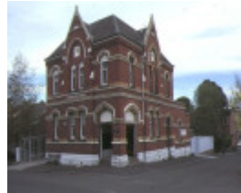
1 parkville post office fitzgibbon street parkville front view