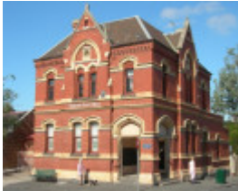
PARKVILLE POST OFFICE AND QUARTERS SOHE 2008