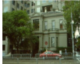
1 former residence 61 spring street july01