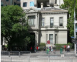
THE FORMER CAMPBELL RESIDENCE SOHO 2008