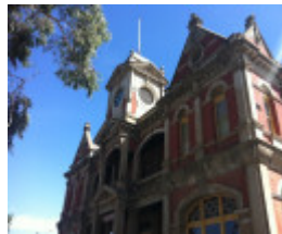
Before Photograph - Reference F3844 2014