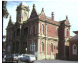
1 eaglehawk town hall mechanics institute & two hmvs nelson cannons eaglehawk side view