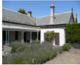
BARWON GRANGE SOHE 2008