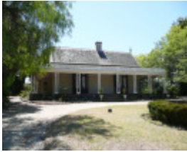
BARWON GRANGE SOHE 2008