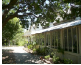
BARWON GRANGE SOHE 2008