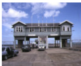
1 princes pier beach road port melbourne entry building front view