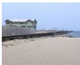
PRINCES PIER SOHE 2008