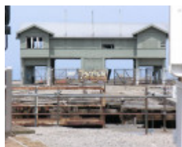
PRINCES PIER SOHE 2008