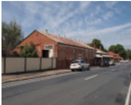
H0278 STAR THEATRE LHA 2015 1.JPG