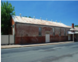
STAR THEATRE SOHE 2008