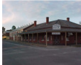
star theatre main street chiltern hotel and theatre