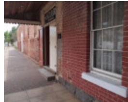
H0278 STAR THEATRE LHA 2015 2.JPG