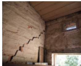
H0278 STAR THEATRE LHA 2015 6.JPG