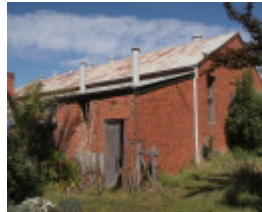
H0278 STAR THEATRE LHA 2015 3.JPG