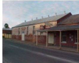
1 star theatre main street chiltern