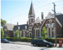
PRIMARY SCHOOL NO.2634 SOHE 2008