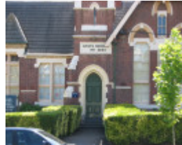
PRIMARY SCHOOL NO.2634 SOHE 2008