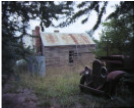
lakeview victoria street chiltern outbuildings may1981