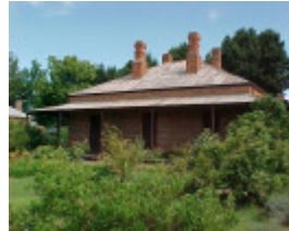
1 lakeview victoria street chiltern front elevation jan00