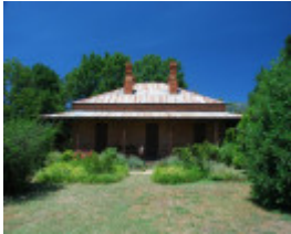
LAKE VIEW SOHE 2008