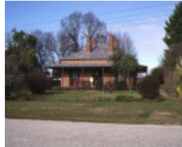
lakeview victoria street chiltern front elevation jul1994