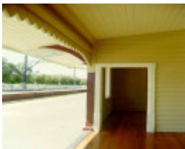
clayton railway station upside building sw nov1998