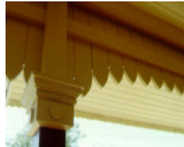
clayton railway station platform building detail sw nov1998