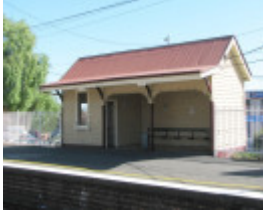
CLAYTON RAILWAY STATION SOHE 2008