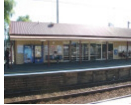
CLAYTON RAILWAY STATION SOHE 2008