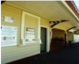
clayton railway station downside platform building sw nov1998