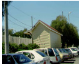
clayton railway station rear upside building sw nov1998