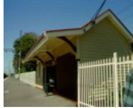
1 clayton railway station upside platform building sw nov1998